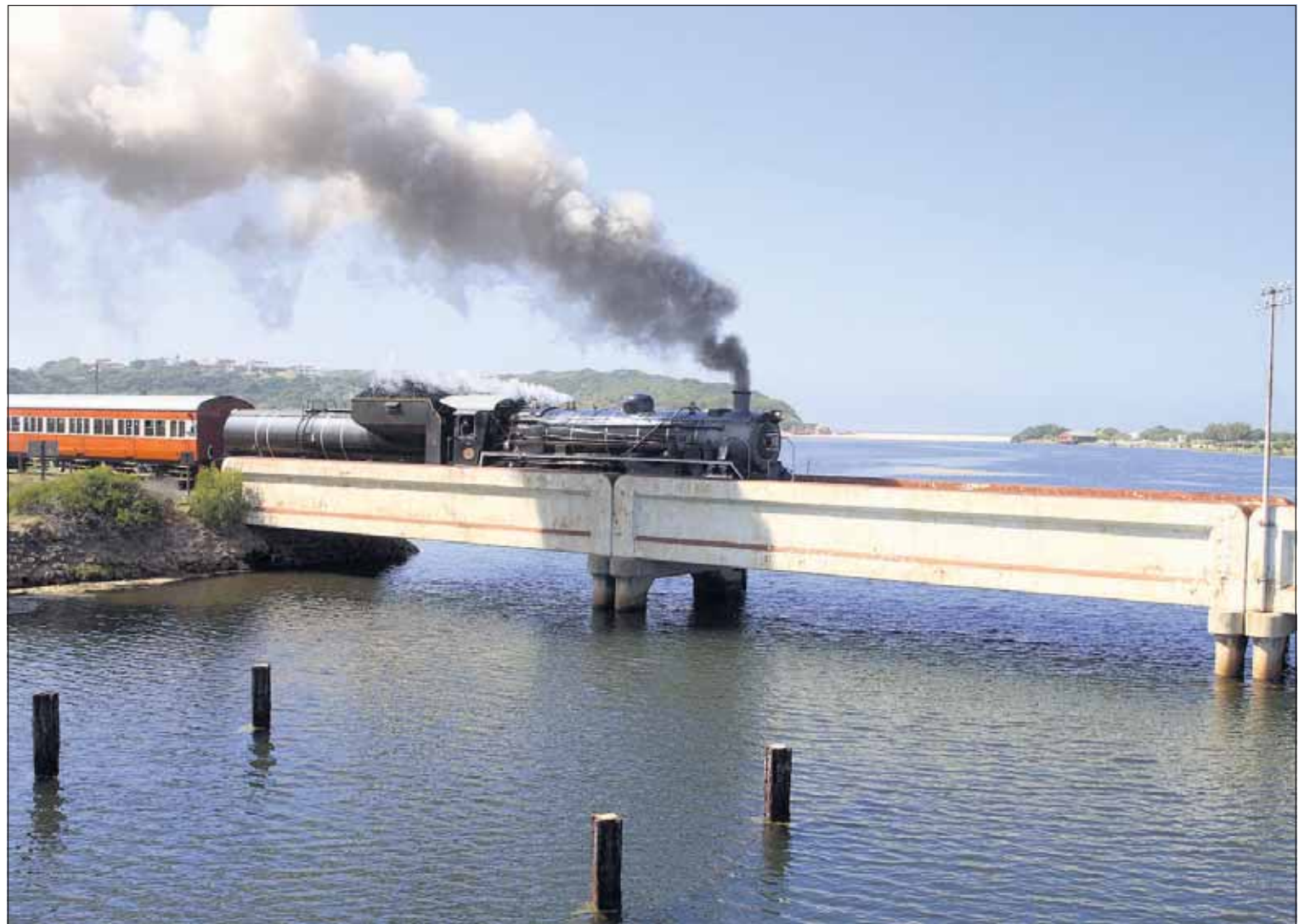
INTO THE SUNSET: Above, the Choo Tjoe treats tourists to a scenic, yet sometimes scary trip; below, Ben van Jaarsveld, the driver.

Quickly through a dark tunnel and we begin our descent to the sea. In the distance the ocean